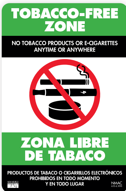
12X18" ALUMINUM SIGNS

We are happy to provide this at no cost to help you communicate your school policy. Prominently displaying signs that declare your school a tobacco-free zone is an essential step to ensuring widespread understanding and compliance of your policy.