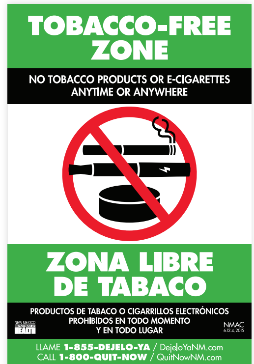
24X36" LAMINATED INDOOR POSTERS