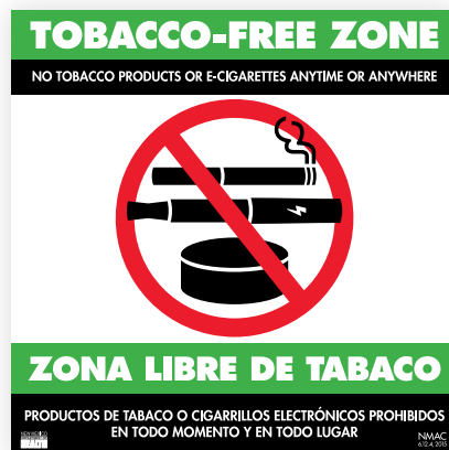
8X8" WINDOW DECALS